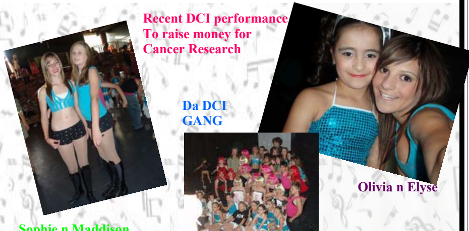
Recent DCI performance To raise money for Cancer Research

Don't forget to check our website: www.johnnyyoungtalentschool.com.au